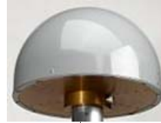
CUT00 (TRM 59800.00 SCIS)

E1 L1 L1 B1 E5A L2 L2 L1 B2 E5B L5 L5 L2 B3 A+B LEX