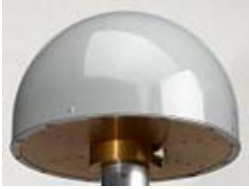
CUTB0 (TRM 59800.00 SCIS)