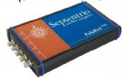
CUT1 (SEPTENTRIO POLARX4)

E1 L1 L1 B1 E5A L2 L2 L1 B2 E5B L5 L5 L2 B3 A+B LEX