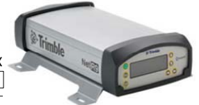
CUTA (TRIMBLE NETR9)

L1 L1 E1 L1 L2 L2 B1 E5A L2 L5 L3 B2 E5B L5