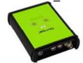
CUAA (JAVAD TRE_G3TH_8)

L1 L1 E1 L1 L2 L2 B1 E5A L2 L5 L3 B2 E5B L5