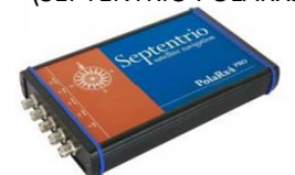
CUAI (SEPTENTRIO POLARXS)