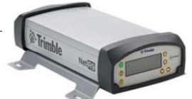
CUT2 (TRIMBLE NETR9)

L1 L1 E1 L1 L2 L2 B1 E5A L2 L5 L3 B2 E5B L5