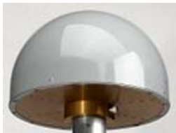
CUTC0 (TRM 59800.00 SCIS)