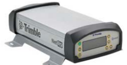
CUTO (TRIMBLE NETR9)

E1 L1 E5A L1 L2 L1 B1 E5B L2 L5 L2 B2 A+B L5