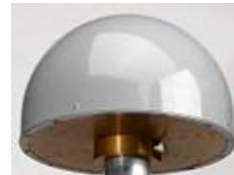
CUTA0 (TRM 59800.00 SCIS)

E1 L1 L1 L1 B1 E5A L2 L2 L2 B2 E5B L5 L5 L3 B3 A+B LEX