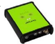
CUT3 (JAVAD TRE_G3TH_8)

L1 L1 E1 L1 L2 L2 B1 E5A L2 L5 L3 B2 E5B L5